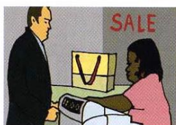
a shop assistant