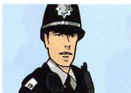
a police officer

We use a/an when we say what people's jobs are. He's a builder . NOT He's builder . She's a teacher and he's an engineer .