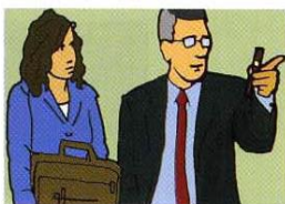
a businessman/ businesswoman