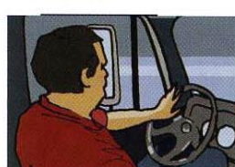
a lorry driver also a train/bus/taxi driver